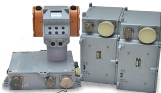
Fig.3. Digital weapon stabilizer SVU-500-10P [1-4]

Non – smoothness of guidance at low rates, exact readings – not more than 0.7.