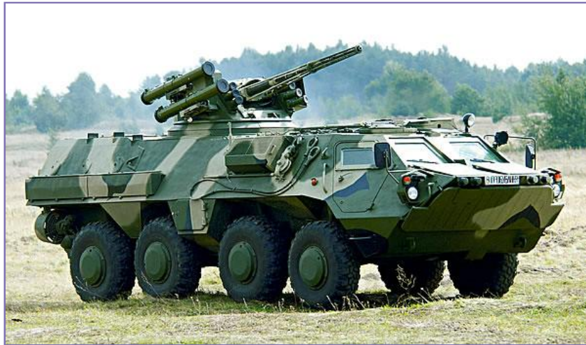
Fig. 2. Scheme of interaction of streams of IFMS, authors': M – material flow, E – energetic, I 1 – management information, I 2 – organization of information functioning of IFMS, W- ware [1-4,17-19]

According to special press, Ukrainian weapon stabilizers are considered to be one of the best in Europe [17-19]. PJSC "RPA "Kyiv automatic plant" produce one of the most reliable and flawless ISC for LAV [17-19].