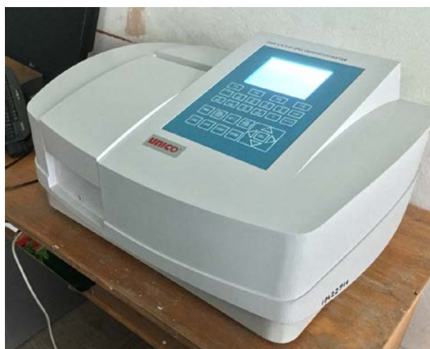
Fig. 2. Spectrophotometer UNICO 2800 used for spectral analysis of combustion residue extracts

The spectral data were processed by identifying local maxima and minima of transmission and determining the corresponding wavelengths using the built-in peak search function of the spectrophotometer. Comparative analysis of spectral curves was performed to detect common patterns and characteristic features across all investigated samples, with particular attention to the identification of stable spectral extrema. This approach enabled the evaluation of similarities and differences in the chemical composition of combustion residues and provided a basis for assessing the quality and environmental safety of solid biofuel materials derived from oil flax stems in comparison with conventional wood-based fuels.