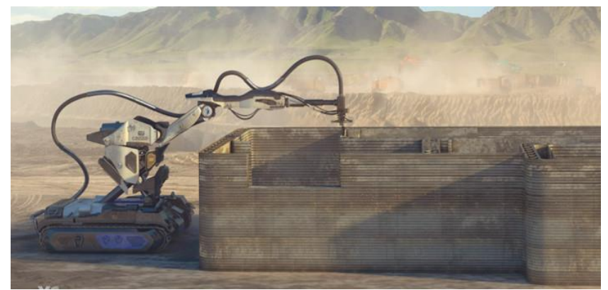
Fig. 3. A 3DP unit for large-scale construction