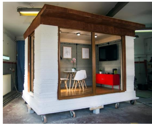
Fig. 8. The first house created in the 3DP technology in Poland