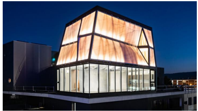
Fig. 9. DFAB House, in Dübendorf – the first inhabited house made in a 3DP technology