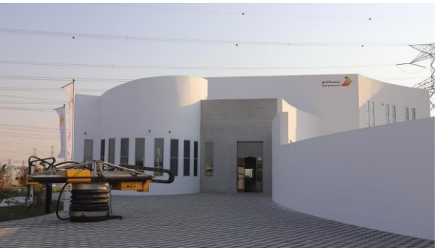
Fig. 6. A facility made in the 3DP technology in Dubai [2]

It should also be mentioned that because of the relative indifference when it comes to the complexity of the project's geometry, the 3DP technology can reduce the material used in the cross-sections, where the internal forces do not require the same dimensions of the cross-section as in the most critical parts of the concrete construction [2, 3]. Local reduction of the cross-section's dimensions, in traditional methods, is not only complicated but also economically unfeasible. Examples of houses made of concrete printed in 3D technology are shown in Figs. 6 to 9. Examples of bridge structures in Figs. 10 and 11.