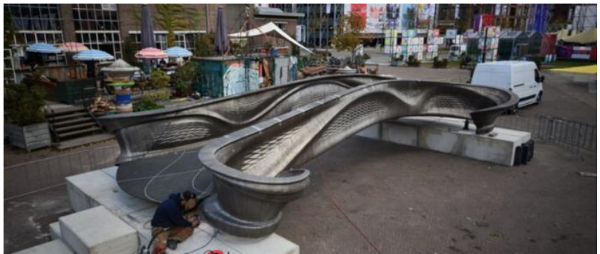
Fig. 12. A stainless-steel bridge construction, made with the use of an automated 3D print technology

technologies are the EDB, DMLS/SLM or the Laser Cusing. An example of a metal bridge designed and made in 3D printing technology is shown in Fig. 12.