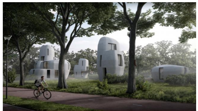
Fig. 7. Printed houses - Australia