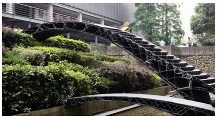
Fig. 13. A pedestrian bridge made of plastic in the 3D print technology, where the span measures 11 meters

Answering the needs of elements bearing with special requirements, it is possible to use polymer materials with added strengthening components (fibers etc). It is surely a high potential and very promising technology, considering the fast development of the composite construction designs. An example of this is the footbridge with a span of 11m shown in Fig. 13.