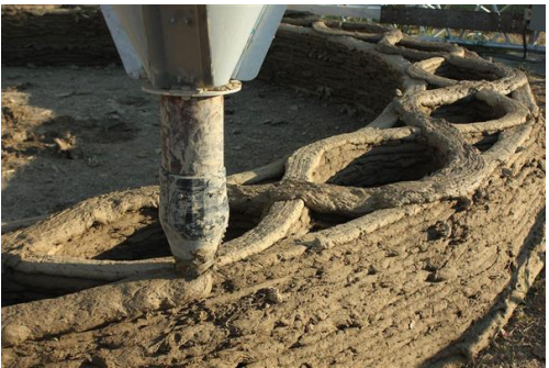
Fig. 4. 3D printing in civil engineering