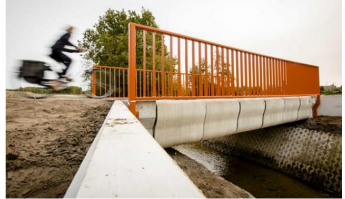
Fig. 11. A prestressed concrete bike bridge in the Netherlands, reinforced with fibers

Metal 3D printing. A significant development in the 3D technology has also been spotted in the construction processes using steel as it's building material. This 3D printing technology uses laser to bind powdered materials – including metals [4, 5]. The high-powered laser emits a laser beam that heats the powder to bind together it's particles, which are then dispersed in thin layers. The technology is called SLM – which stands for Selective Laser Melting. After the printing process is done, selected parts go through a heat treatment. This technology connects the desired freeform design feature with good mechanical properties. It also significantly reduces the construction time because it is quicker than traditional foundry processes thanks to the direct data use from the CAD softwares. It could reduce the needed assembly time and costs as well. A visible drawback of the presented method is the cost of the needed industrial printing units' components for 3DP (with the use of metal) – such as the galvanometric scanner or the iterbic laser. Other, commonly known, metal 3DP